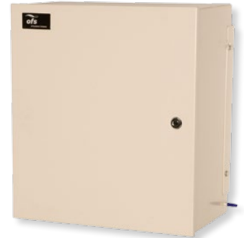
Closed V-Linx FDH