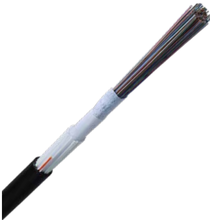
RollIR Central Core Rollable Ribbon Fiber Optic Microcable