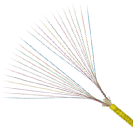
R-Pack Rollable Ribbon Cordage

Compact Cordage Featuring Rollable Ribbon Technology Improves Termination Efficiency