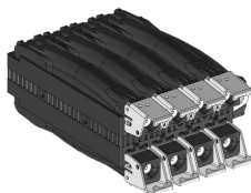
8-PORT (2 Rows)