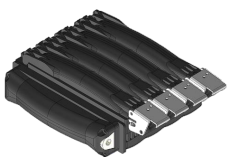
4-PORT (1 Row)